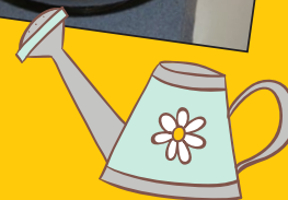
(Pictured: Stephanie Alexander Kitchen Garden Foundation Program - see article next page)